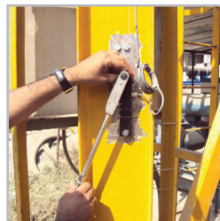
STRAIN GAGE TYPE SILO WEIGH SYSTEMS