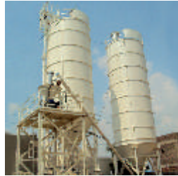
GGBSF BULK CONVERSION PLANT