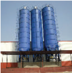
MASA PRECAST BLOCK PLANT