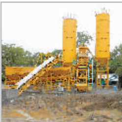
RADIAL ARM CONVEYOR WITH PIT MOUNTED HOPPER