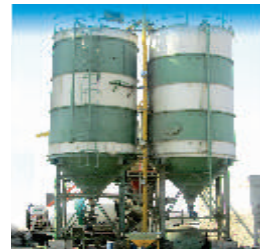
VERTICAL SCREW FEEDING SYSTEM