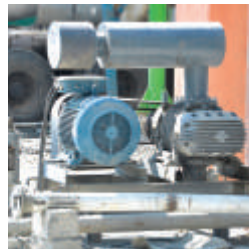
BULKER UNLOADING SYSTEM